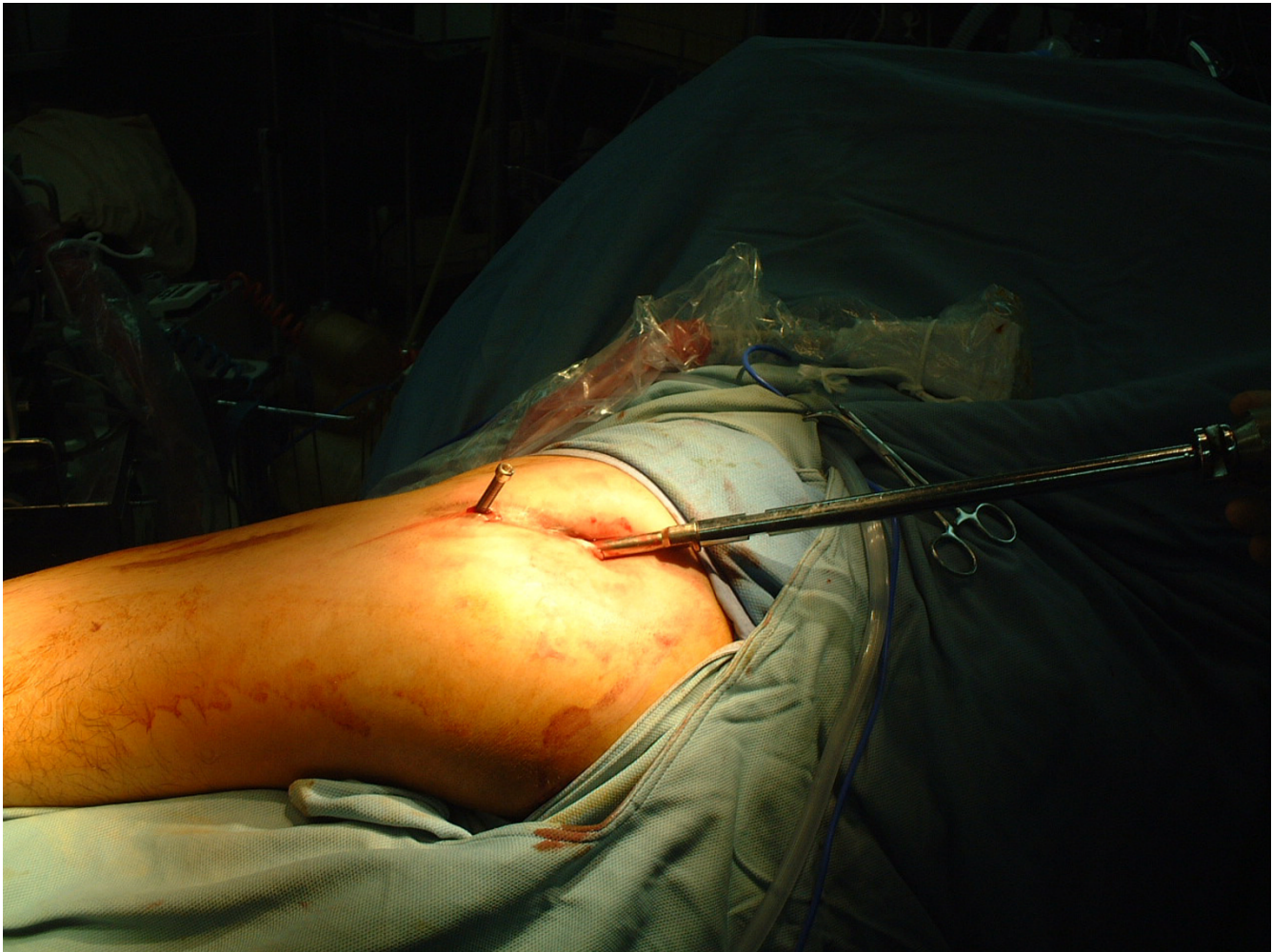
Figure 3 Tube sleeve. The custom-made tube sleeve is used in the minimal invasive technique for soft tissue protection.