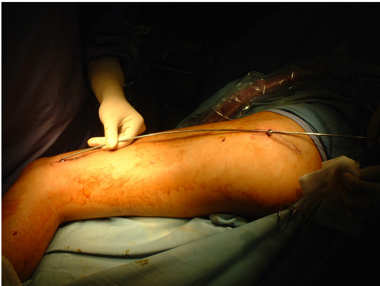
Figure 2 Long axis of femur. The three points of the locking screws form a line that indicates the long axis of femur.