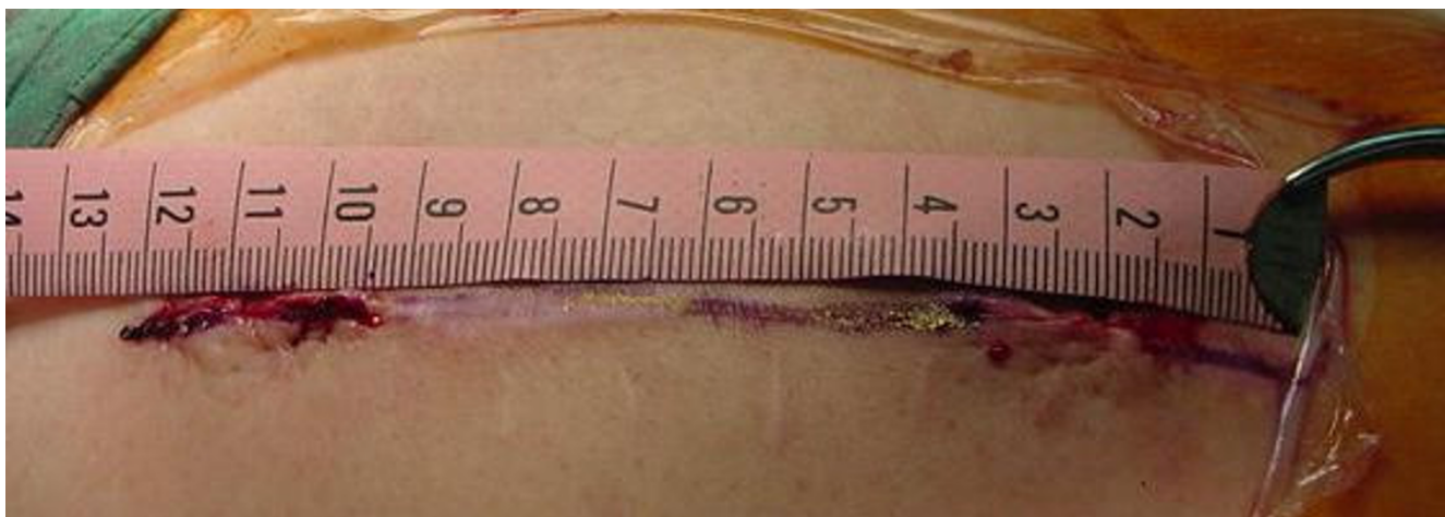
Figure 4 2.5 cm proximal wound. The proximal wound is 2.5 cm in length, which is smaller than previous wound that is 10 cm in length.

linear probes can give a deeper and wider view [7]. Therefore, the morbidity obesity, heterotopic bone growth or deep seated implant in bone may be not feasible for this technique. The surgeons should consider another modality such as intra-operative fluoroscopy or conventional open procedures.