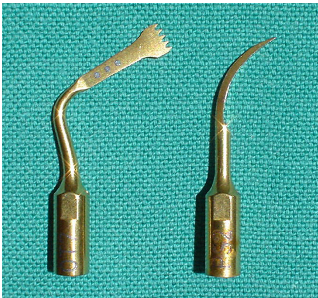
Figure 3 Two examples of available tips. Left side: The preferred blade.