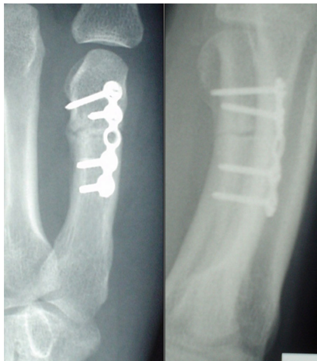
Figure 4 The correction obtained with closing wedge osteotomy.

ess using this new device, although in the future, it should be possible to minimize the bony exposure. In our patient the postoperative healing of the wound and the bone consolidation (Figure 4) were smooth. The duration of postoperative sick leave was four weeks which is more rapid than the usual recovery period. The patient regained full use of his finger according to the state before the fracture. At no point was there any loss of sensitivity. The patient as well as the surgeons were fully satisfied with the result.