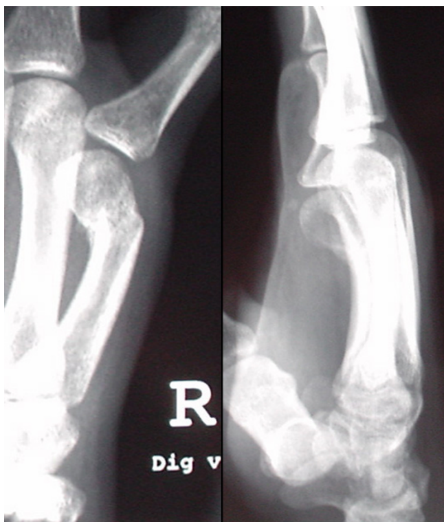
Figure 1 Malunion of the fifth metacarpal bone of the right hand.

tals produce electrical current while under mechanical pressure. The reciprocal effect, by which the crystals are deformed when under electrical current, was then discovered a while later. This is the effect being used by the Piezosurgery Device ® . In this device, the electrical field is located in the handle of the saw [3]. Due to the deformation caused by the electrical current, a cutting – hammering movement is produced at the tip of the instrument. These micro movements are in the frequency range of 25 to 29 kHz and, depending on the insert, with an amplitude of 60 to 210 \mu\text{m} . This way only mineralized tissue is selectively cut. Neurovascular tissue and other soft tissue would only be cut by a frequency of above 50 kHz [3-5]. Depending on the strength of the bone and the blade geometry, the efficiency of the cutting can be regulated by the frequency modulator and the power level. For cooling there is an integrated pump with five different working levels. This pump automatically washes physiological solution to the area being cut. The cost of the device is about 7.000 USD. Additional costs per operation are for the cooling liquid and are in the range of a few dollars. We have used the Piezosurgery Device ® by Mectron [Italy] [3] for the first time in osteotomies of the long bone in the field of hand surgery. We will report on our experience with one case, with a follow up time of one year.