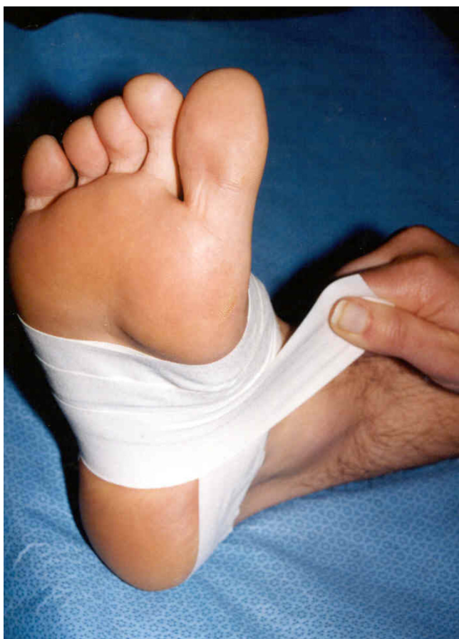
Figure 1 Low-Dye taping.

Participants in the taping group were then taped using the low-Dye taping technique[13] (participants allocated the sham treatment did not receive tape). The skin was first swabbed with alcohol and then Leuko® Spray Adhesive (Beiersdorf Australasia Ltd) was sprayed on the foot to assist tape adhesion. Low-Dye taping was then sequentially applied using Leuko® Premium Plus (flesh coloured) Sports Tape 3.8 cm wide (Beiersdorf Australasia Ltd.). The technique used (Figure 1) has been described in detail elsewhere[13]. Tape required for one application cost approximately AU$1.00. In the absence of adverse events, participants allocated to taping were instructed to leave the tape on until their follow-up appointment (one week later). Care was taken that study participants did not meet by ensuring they exited the building by a different doorway to the one through which they entered.