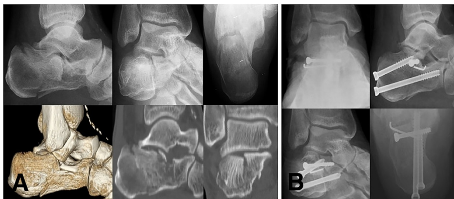
Figure 2 Radiologic evaluations of a 55 year old male patient with Sanders type-II intra-articular calcaneal fracture treated with open reduction and internal fixation using the sinus tarsi approach. (A) Preoperative plain radiographs and CT scans (B) Postoperative plain radiographs.

but no patient required intervention. One case of peroneal tendinitis was observed in the ELA group. However, no patient required operative treatment. No peroneal tendinitis was observed in the STA group. Five (8.3%) of 60 patients in the ELA group complained of subtalar stiffness, and one required exploration and arthroscopic subtalar release. The indications of arthroscopic subtalar release were isolated subtalar stiffness with pain on weight bearing which was aggravated by walking on uneven ground; articular incongruity less than 2 mm at the posterior facet of the subtalar joint on CT scans; and failure to respond to conservative treatment. The procedure was debrided of fibrous tissue in the sinus tarsi and lateral gutter and released the posterior talocalcaneal facet. Arthroscopic subtalar release was performed before posttraumatic arthrosis occur [22]. Four patients reduced their pain by doing subtalar circle