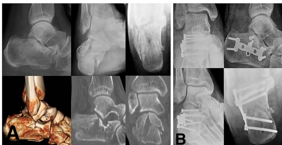
Figure 3 Radiologic evaluations of 52 year old male patient with Sanders type-II intra-articular calcaneal fracture treated with open reduction and internal fixation using the extensile lateral approach. (A) Preoperative plain radiographs and CT scans (B) Postoperative plain radiographs.

The most popular approach for the open reduction and internal fixation of calcaneal fracture has been the ELA [9,12,13,23]. This approach provides excellent visualization and allows access to manipulate and rigidly