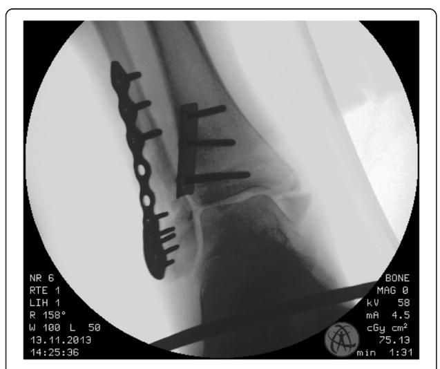
Fig. 3 Intraoperative X-ray; Mortise view after fixation of the posterior malleolus with a with an three-hole antiglide-plate and a locking plate for the fracture of the lateral malleolus

Routinely, an incision beginning 1-2 cm distally to the tip of the medial malleolus over the medial malleolus in the direction of the middle of the distal tibia is performed. In the next step, we start with the exposure of