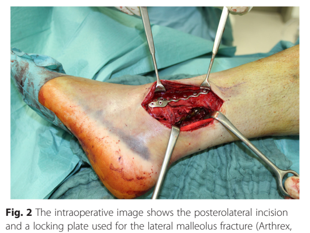
and a locking plate used for the lateral malleolus fracture (Arthrex, München, Germany) and one-third tubular plate used for the posterior malleolus fracture (Synthes, Umkirch, Germany)

type and localization, we normally use a lag screw performed as it is described in the AO manual followed by a one-third tubular plate as a neutralization plate (Synthes, Umkirch, Germany). In case of a multifragmentary fracture, distal fracture or in case of osteoporotic bone a lateral locking plate or a locking hook-plate is used (Arthrex, München, Germany) (Fig. 3). If the patient only presents with a lateral malleolus fracture, a standard lateral incision is performed.